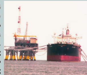
LPG Offloading Terminal BETARA

ZEE was awarded the design of the two offshore terminals (LPG and Condensate) by Sembcorp which includes a fixed Process Unit, related mooring Dolphins, two Offloading Terminals and